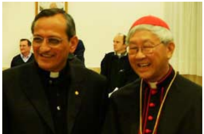
RMG-Rome, Italy - 27 March 2006 - Fr Pascual Chavez, Rector Major of the Salesians and Cardinal Joseph Zen Ze-kiun during a meeting with Salesians in the Generalate to whom he the 'Good Night'.