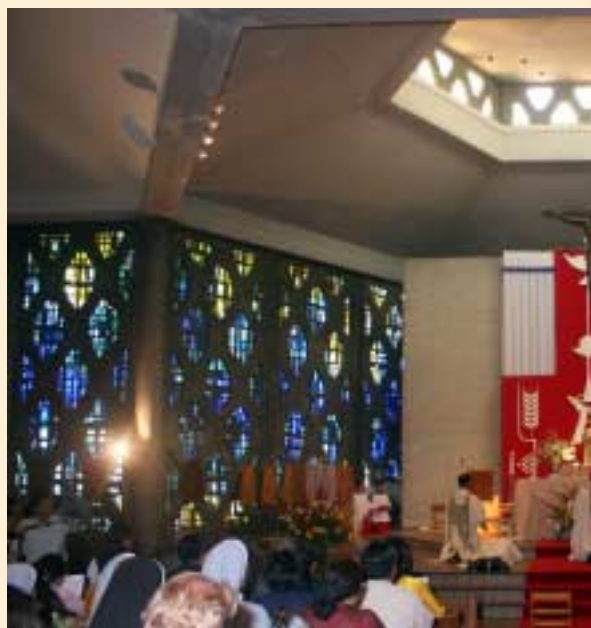
Ordination Mass. The assembly of people pray over the All you holy men and women