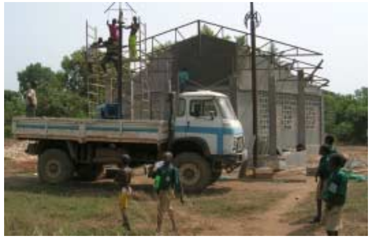
The “voice” of the St. Ann church is being put in place; it will call the faithful to worship for year to come.

Thus the St. Ann church has become a reality and a source of pride and joy for the entire population of Yongro, Tholomosor and Mahera villages, Catholic and Muslim alike.