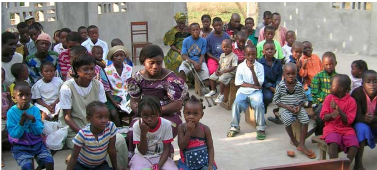
We begin with the ABC of the Catholic faith: the pioneers of the St. Ann Catholic community.