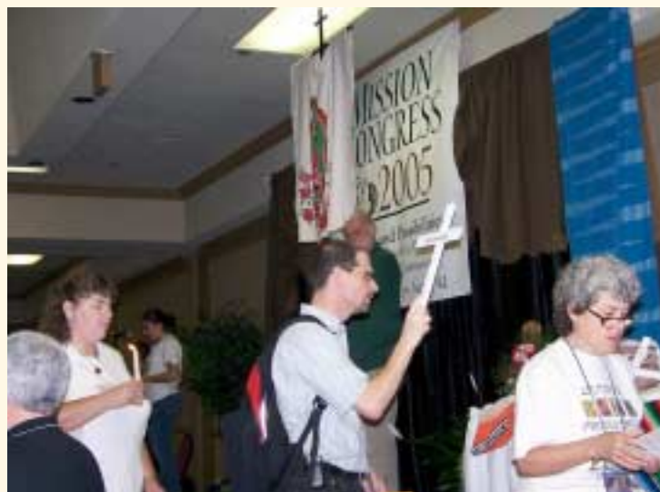
Moving Prayer Service for all immigrants who have died trying to cross the Mexican-Arizona border.