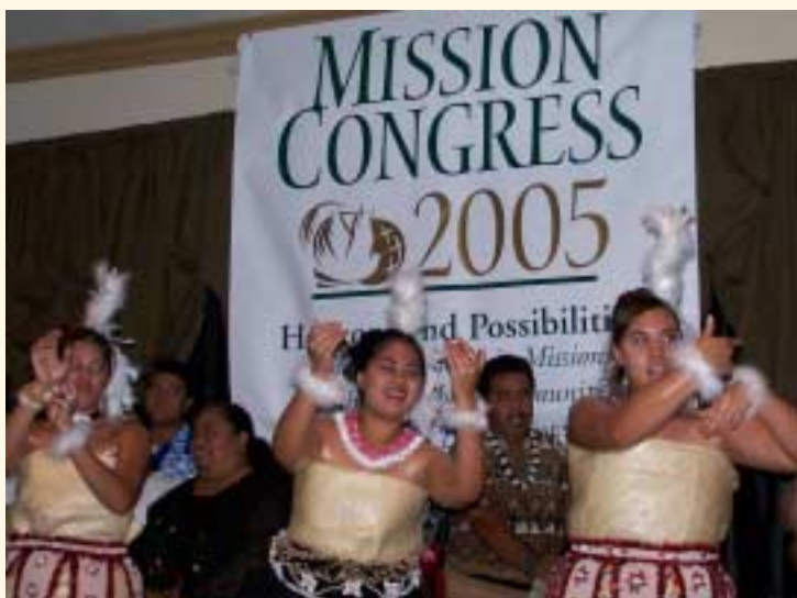
Samoan Dancers entertain during the cultural evening during the Congress. Tucson, AZ October