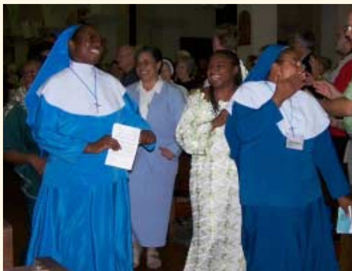
Beaming Nigerian Sisters lead the Entrance Procession at the closing liturgy at St. Augustine Cathedral.