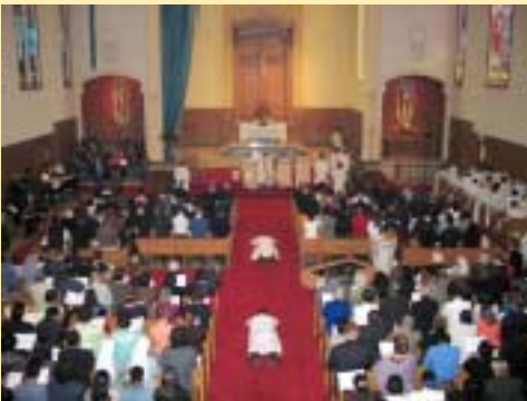
The deacons-elect are prostrate during the praying of the Litany of the Saints in the ordination Mass.